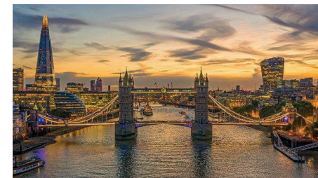
The River Thames, London