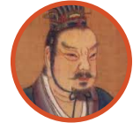
Emperor Wu Ding