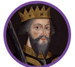
William Duke of Normandy