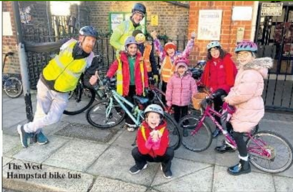
The West Hampstead bike bus